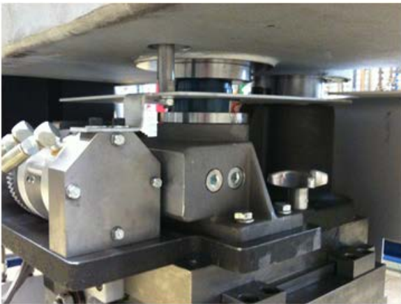
New Version Tube Height Jack 59-17502-2