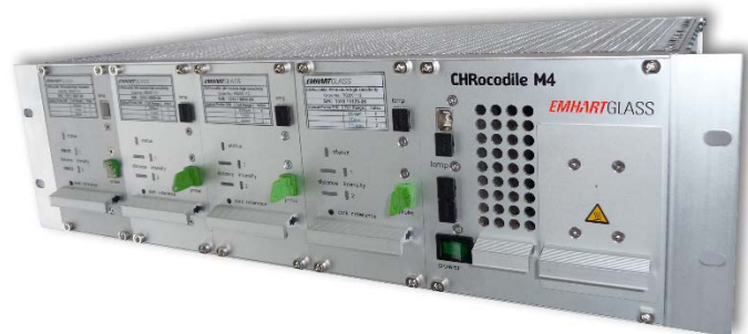
Electronics are housed in a single rack-mount console.