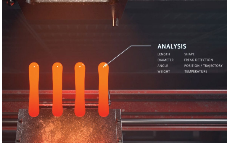
GobRadar measures the gob immediately after the shear cut.

The cameras are mounted in a protective housing that is specially designed to withstand the harsh environment of