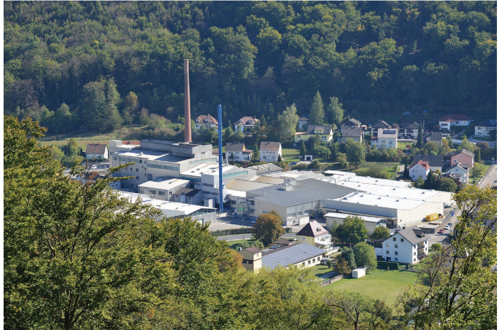
The SGD production facility at Kipfenberg, Germany.

Originally founded by local breweries in 1871, the plant