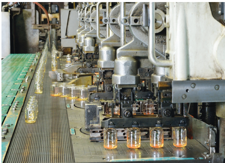
Small ware containers with dual row transport.

SGD. "Back in 2010, we began standardising all our IS machines across the group" he says. "For us, the scope of the new development was to continue using all our existing mould sets but adopt a large mould diameter. Once BEG had been confirmed as the project partner, we shared our existing mould designs and variable equipment with them and started work on a new design for a machine structure that would include all our variable equipment."