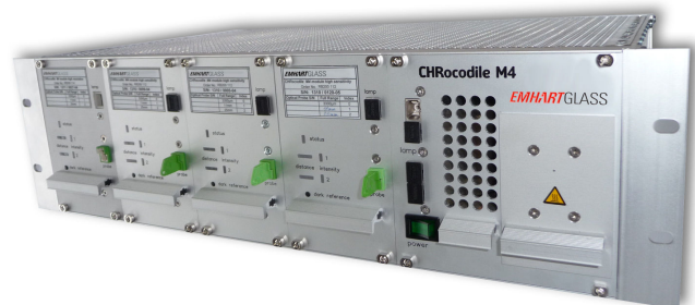
Electronics are housed in a single rack-mount console.