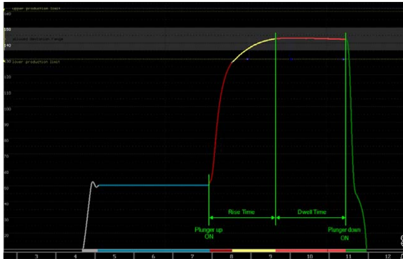
Plunger Rise- and Dwell-Time between Plunger up and down movement. Display: PPC full stroke sensor.

Up to now, controlling the plunger rise time and thus the full contact time between plunger and glass was hardly done systematically for all cavities. The result depended on many influencing factors like friction in the plunger mechanism, glass viscosity, loading situation etc. Even if it was controlled systematically, pressing with only one pressure offered a limited range to influence the plunger rise time without risking other quality issues.