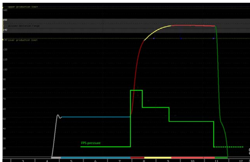
Press curve and FPS pressure sequence shown as example.

FlexIS Plunger Up Control uses multi pressure pressing to have a wide range of influence on the plunger rise time. By continually adjusting the initial pressure levels and also the switch points (timing) for stepping between the pressure levels, the system makes multi pressure pressing usable in a comfortable way without risking any quality issues.